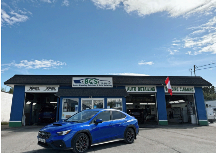
Bravo Cleaning Services in Terrace, BC, grows local talent through the WorkBC Wage Subsidy program

Bravo Cleaning Services in Terrace, BC has experienced positive results through participation in the WorkBC Wage Subsidy and Get Youth Working programs.